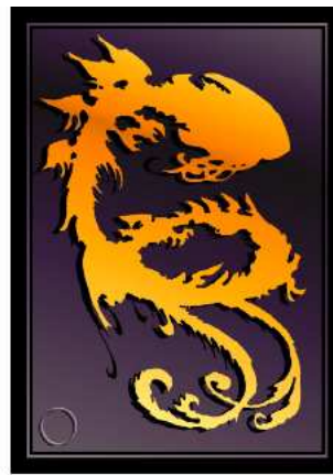
ROYAL MOON TROPHY CARD