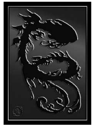
DARK MOON TROPHY CARD

Finally, for winning an Organised Play event or for creating a submission that becomes a submission of the month in its category you can gain the Fire Moon Trophy Card.