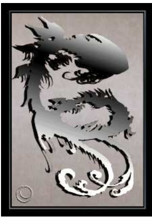
SILVER MOON TROPHY CARD

The Legion of Edadh encompasses Organised Play as well as you contributing to the game in some way. By participating in Organised Play or by submitting battle reports and the like you can acquire Legion Points. Gain enough Legion Points and you get the Silver Moon Trophy Card. Acquire further Legion Points and you will get the Blood Moon Trophy Card. Garner more Trophy Points and the Royal Moon Trophy Card will be yours. And with still further Legion Points you get the Dark Moon Trophy Card.