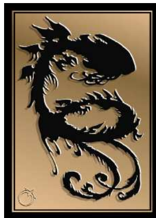
FIRE MOON TROPHY CARD

Finally, for winning an Organised Play event or for creating a submission that becomes a submission of the month in its category you can gain the Fire Moon Trophy Card.