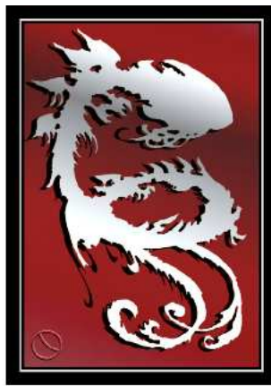
BLOOD MOON TROPHY CARD